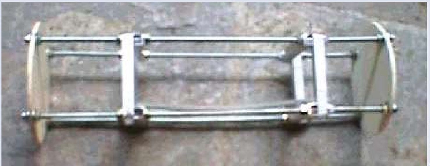
The frame is built of 4 threaded bars with nuts holding all the components together. A bit time consuming but highly adaptable to a wide variety of different R/C brands